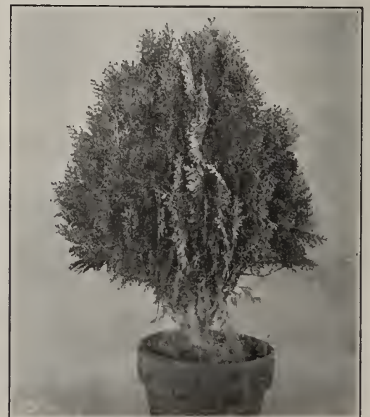
BERCKMANS' GOLDEN ARBORVITAE